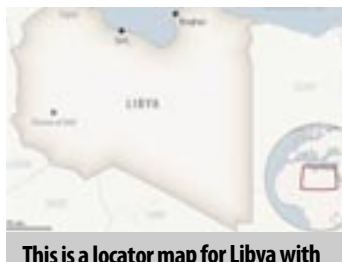
This is a locator map for Libya with its capital, Tripoli.

A boat carrying dozens of migrants trying to reach Europe capsized off the coast of Libya, leaving more than 60 people dead, including women and children, the U.N. migration agency said.