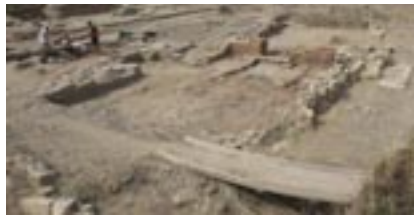
The archaeological site of the Phanagoria synagogue.

The remains of a synagogue from the time of the Second Temple were discovered in the ancient Grecian city of Phanagoria, located in what is today Southwestern Russia between the Sea of Azov and the Black Sea.