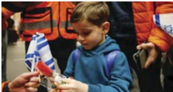
Ukrainian Jews arrive in Israel after being driven out by Russian forces.

Ahead of the anniversary of the Russian invasion of Ukraine, Israeli officials reported that in the last year, 15,000 Ukrainian Jews have immigrated to Israel.