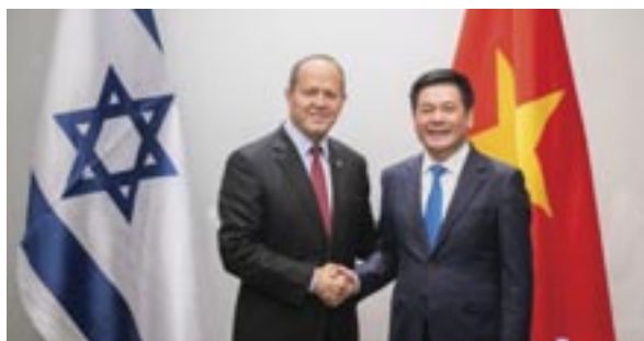
Israeli Economy and Industry Minister Nir Barkat is seen shaking hands with his Vietnamese counterpart, Nguyễn Hồng Diên.

Economy and Industry Minister Nir Barkat has orchestrated a significant advancement for Israeli travelers, enabling them to reclaim 8.5 hours of travel time on journeys to Vietnam.