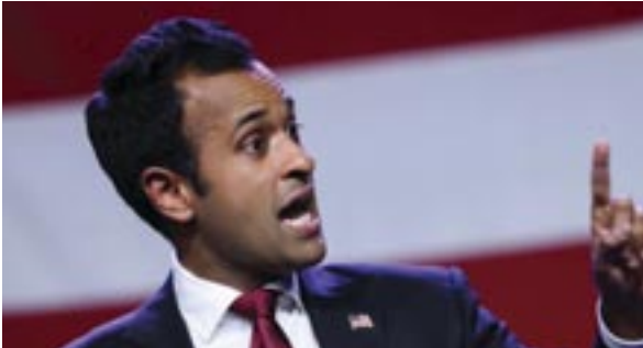
Republican presidential candidate Vivek Ramaswamy speaks at the Republican Party of Iowa's Lincoln Day Dinner in Des Moines, Iowa.

Comparing this paltry sum to the exorbitant amounts that the US has invested in other countries, such as Afghanistan, highlights the unparalleled value and cost-effectiveness of Israel's contributions. The billions of dollars' worth of ammunition left behind in Afghanistan only served to strengthen America's enemies and undermine its interests.