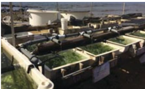
Layout of the land-based, outdoor aquaculture system as was stationed at the IOLR Institute.

It might not sound very tasty, but researchers at Tel Aviv University and Haifa's Israel Oceanographic and Limnological Research Institute (IOLR) have developed an innovative method for growing an unlimited amount of seaweed boosted with vitamins, minerals, healthful carbohydrates, proteins and dietary fiber for both human and animal needs.