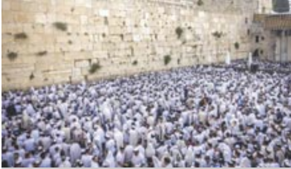
JEWS PRAY at the Western Wall on Jerusalem Day. The Kotel is the most visited site in Israel, according to the Tourism Ministry.

people visited Israel. How this country can handle such a volume of tourists is nothing short of amazing. According to cia.gov , Israel, with a population of about 9 million, has at its disposal barely 22,000 square kilometers. France, with a population of 68.3 million, has an area covering over 643,000 sq. km.