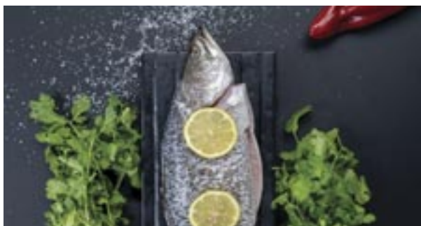
Barramundi fish from the ecological farm to your plate