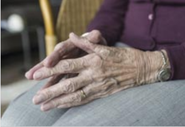
Elderly hand (illustrative)

fied, but also the most promising strategies to prevent getting old and to make humans young again through drugs that remove old cells can be tested on lab animals before being used on patients, they continued.