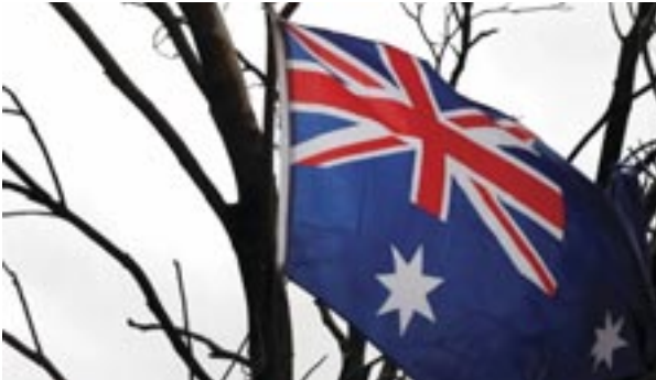
An Australian flag is seen hung in a tree burnt by bushfire on the property of farmer Jeff McCole in Buchan, Victoria, Australia