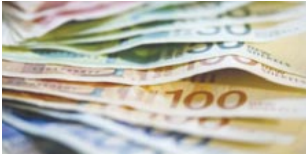
VARIOUS ISRAELI banknotes are displayed for an illustrative photo. The economy is well on its way to the pre-pandemic standards of budgetary discipline.

The World Bank lowered its global growth forecast for 2022 from 4.1% to 2.9%, following growth of 5.7% in 2021. The more distant future does not bode well, either, with a growth forecast of 3% for both 2023 and 2024.