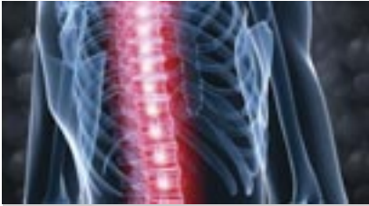
A 3D image of a human spinal cord.

of the spinal cord or the nerves at the end of the spinal canal. These injuries can cause permanent changes in strength, sensation and other bodily functions, and in severe cases, can lead to long-term paralysis, for which there is currently no cure.