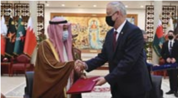
Defense Minister Benny Gantz signs a Memorandum of Understanding with the Kingdom of Bahrain.

Defense Minister Benny Gantz met with King Hamad bin Isa al-Khalifa and signed a historic public Memorandum of Understanding (MoU) with the Kingdom of Bahrain, officially establishing security ties between the two Middle Eastern countries.