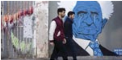
People walk by graffiti art of the late David Ben Gurion, Israel's first prime minister, on a street in Tel Aviv's Neve Tzedek neighborhood.