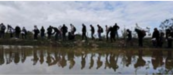
Palestinians visit Gaza Valley during a trip organized by the United Nations in central Gaza Strip.

The United Nations is set to begin the restoration of a historic valley in the Palestinian Gaza Strip, hoping to transform it from a landfill and sewage dump into a vibrant nature reserve in a planned $66 million project.