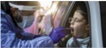
A healthcare worker takes swab samples from an Israeli child at a COVID-19 drive-through testing site in Modi'in

resources, investment, and innovation,” and help boost competition and reduce costs.