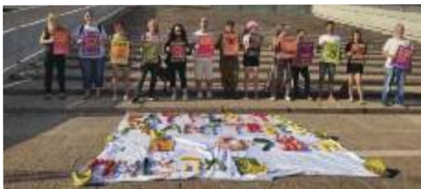
Climate activists are seen in Tel Aviv advocating for a Plant Based Treaty.

Activists have taken to Tel Aviv and cities around the world to push governments to fight climate change by putting food systems at the forefront of their green policies.