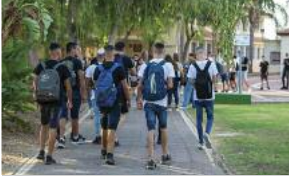
Students in Afula on their way to school as new school year starts.

not in contact with a COVID-19 patient during the past two weeks.