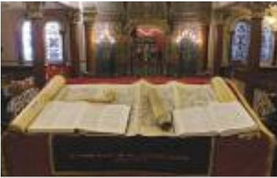
MIDDLE STREET Synagogue, Brighton, England.

Oxford, a set of laws that restricted Jews' rights to engage with Christians in England, according to a report in the Telegraph .