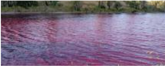
The bright red color of the waters of Lake Motro between the main Ounianga Lakes of northern Chad, Central Africa

told the Jordanian Al Ghad news that the red color could have been caused by algae, iron oxide or the addition of substances by humans to change the water's color.