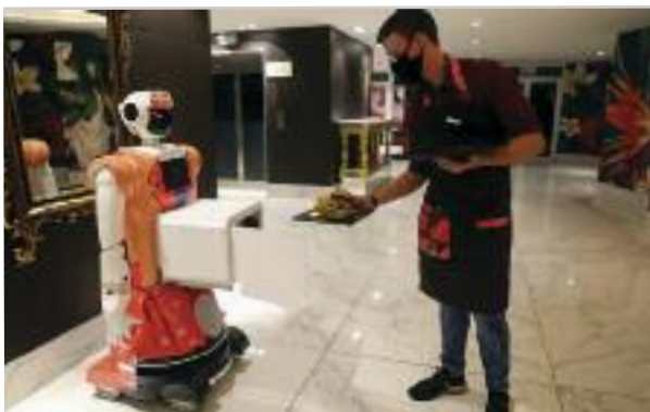
PLACING FOOD in a box attached to AI-powered robot Ariel for delivery to a guest at Johannesburg's Hotel Sky.

Israel ranked second in the world after the United States in coronavirus solution innovation, according to a new report by research center StartupBlink and placed ahead of Canada, Belgium and Switzerland among the top spots. The top-ranked countries were unchanged from last year.