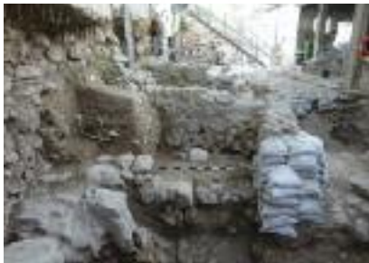
The excavation area in the City of David.