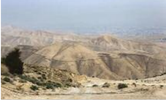
A view of the Judean Desert

horses.' And he asked, 'Which route shall we take?' [Jehoram] replied, 'The road through the wilderness of Edom.'"