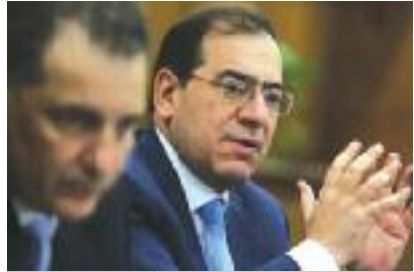
EGYPT'S Petroleum and Mineral Resources Minister Tariq al-Mulla attends a news conference in Cairo.

Israeli president, prime minister and senior Foreign Ministry officials, the ambassador's schedule included meetings with the regional cooperation minister, tourism minister, and the director general of the science and technology ministry, all of which were quickly publicized on Twitter in English, Arabic and Hebrew, along with photographs.