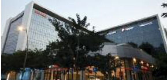
High-tech development centers in Herzliya Pituah