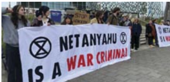
Activists hold up a banner denouncing Prime Minister Benjamin Netanyahu for Israel's actions during the war with Hamas as they demonstrate at the entrance of the International Criminal Court in The Hague, Netherlands.

"It is very worrying that Jews in the Netherlands are held responsible for conflicts taking place in the Middle East," read the CIDI report. "It seems as if Israel is being used to beat Jews."