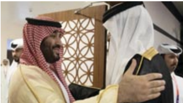
Saudi Arabia Crown Prince and Prime Minister Mohammed bin Salman is received by Qatari Emir Sheikh Tamim bin Hamad al-Thani on the sidelines of the World Cup in Doha, Qatar

Residents of the Middle East, referred to as the Arab world by the West, often hear about various envoys and advisers from the United States and Europe who are involved in the region’s affairs. However, many individuals in the Middle East question the relevance of these broad and inclusive definitions, such as the term “Arab world,” to their own experiences and identities.