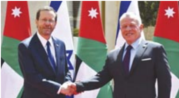
PRESIDENT ISAAC HERZOG shakes hands with Jordan's King Abdullah II in Amman, last year.

“There are three places about which the nations of the world cannot deceive Israel and say we have stolen them out of their hands, and they are the Cave of the Patriarchs, the Temple and the Tomb of Joseph.” All three sites were purchased by our forefathers, Abraham, Jacob, and King David, at a fair price.