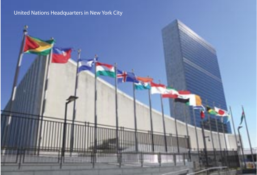
United Nations Headquarters in New York City

Only 9 million people live in Israel—0.1 percent of the world’s population. And yet Israel always makes the biggest headlines and keeps the UN busy.