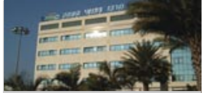
Front view of the HaEmek Medical Center Campus (Almog [Own work], via Wikimedia Commons)

- www.timesofisrael.com , 1 February 2023