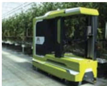
Israeli startup MetoMotion's greenhouse robotic worker picks and packs tomatoes.