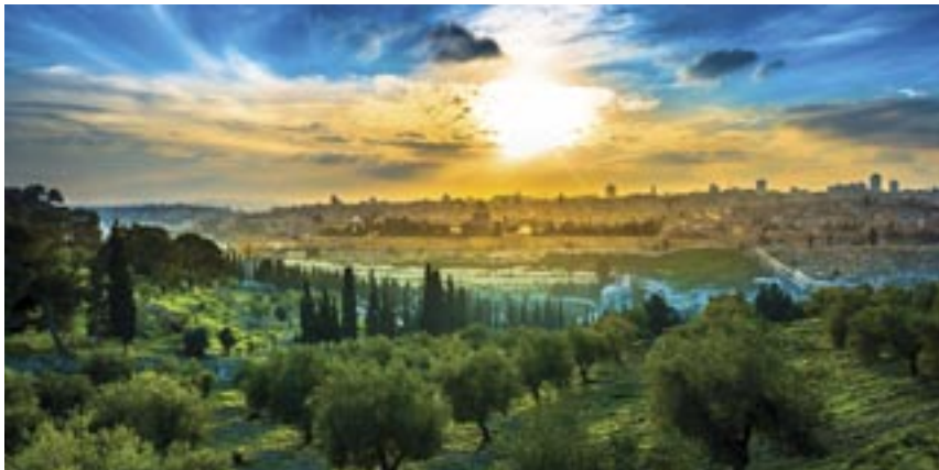
View of the Old City Jerusalem from the Mount of Olives with olive trees in the foreground

Just as the many promises and threats of judgment have come true for Israel in the past, everything that has not yet come to fruition in divine prophecy will also be fulfilled.