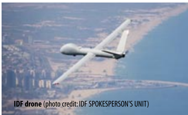
IDF drone

IDF commanders in the West Bank have been given the green light to use armed drones to carry out targeted killings of Palestinian terrorists, with the approval of Chief of Staff Lt.-Gen. Aviv Kohavi.