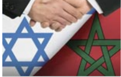
Morocco-Israel (Illustrative)

Before the discovery of large natural gas reservoirs off Israel’s coast, most energy was imported. It was in 1999 when Noble Energy, a Houston-based company, made the first discovery of gas, estimated to be 30 trillion cubic meters. In the meantime, additional fields have been discovered exceeding this enormous amount. Yet Worldometers.info lists Israel’s global share of natural gas reserves at only 0.1 percent. Russia holds 24.3%, Iran 17.3%, Qatar 12.5%, United States 5.3%, and Saudi Ara-