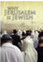
7853 (See Why Jerusalem Is Jewish , Item #1070, $2.)

Incidentally, this writer insists that there is no such thing as “Christian holy sites.” We worship God in spirit and in truth, anywhere and anytime.