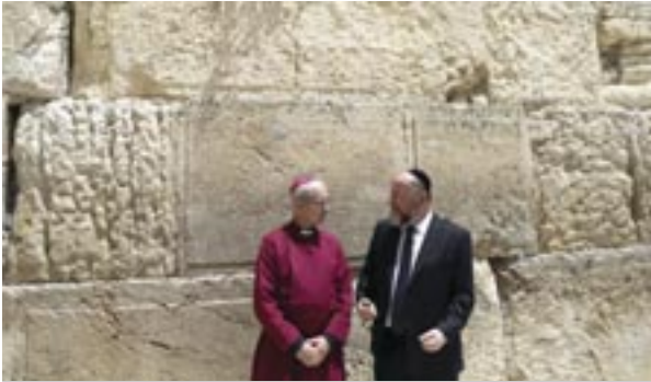
Archbishop of Canterbury Justin Welby and Britain's Chief Rabbi Ephraim Mirvis visit the Western Wall

The Church of England has apologized for the anti-Jewish laws that the Catholic Church in England passed 800 years ago.