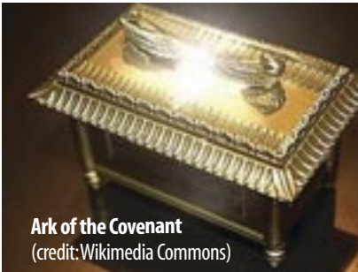
Ark of the Covenant

The last known location of the Ark of the Covenant was in the First Temple's Holy of Holies. However, after the Temple's destruction in 586 BCE, it disappeared.