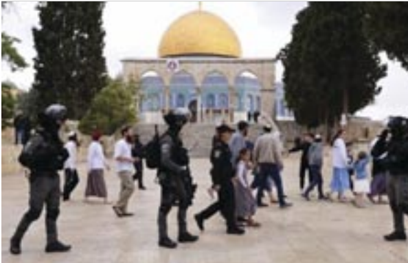
Israeli police accompany a group of Jews touring the Temple Mount, as the Jerusalem holy site was reopened to non-Muslim visitors.

“Ra’am’s position in the coalition, as regards the blessed Al-Aqsa Mosque, will be based on the results of the joint Israeli-Jordanian-international meetings,” Abbas wrote.