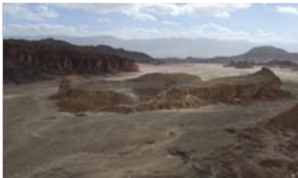
Slaves' Hill in the center of the Timna Valley.