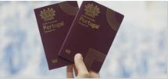
A PORTUGUESE passport conveys all the benefits of a standard EU passport.

The year 1492 was not only the year that Columbus “sailed the ocean blue.” It was also the year that Spain exiled its Jewish population, causing tragedy and hardship to the Jews of Spain and Portugal.