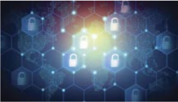
ARMIS: BRINGING hackers out of the shadows.

How many devices do you have? Which of them are connected to the internet? What safety protocols do you have in place to make sure your devices aren't being affected by malicious software?