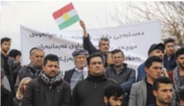
Iraqi Kurds hold a rally to protest against corruption and scarcity of services in the city of Sulaimaniyah