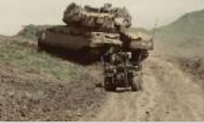
An IDF tank takes part in military drills as part of the “Tnuva” multi-year plan.

role during the recent 11-day war against Hamas in Gaza.