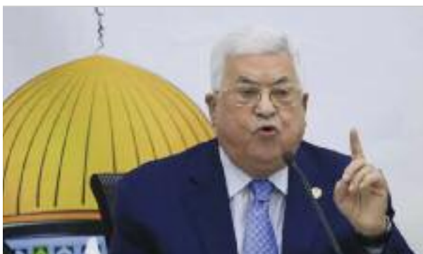
Palestinian President Mahmoud Abbas makes a statement as he attends the Revolutionary Council Meeting of Fatah Movement at the Palestinian Presidential Office in Ramallah.

The Palestinian Authority handed the family of a Palestinian terrorist who murdered two Israelis 30,000 Jordanian dinars ($42,000).