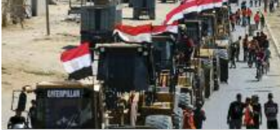
Building equipment, sent by Egypt for Palestinians, arrive in the southern Gaza Strip

controlled media had accused Hamas of helping Muslim terrorists who attacked Egyptian security forces in the Sinai. Hamas has strongly denied the charges, saying it does not meddle in the internal affairs of any Arab country.