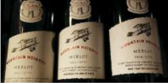
Labels, including the words, “Wine from the land of Israel,” are seen on wine bottles at Tura Winery in Rehelim